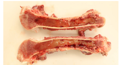
Serous atrophy of fat from chronic weight loss

Thin ewe syndrome was the cause of weakness and death in a sheep flock following the introduction of newly purchased ewes. A classic presentation of internal caseous lymphadenitis (CL) caused by Corynebacterium pseudotuberculosis in sheep, it leads to abscess of internal organs, chronic weight loss, and ill thrift. These ewes also had a chronic bronchopneumonia. Peripheral CL causes abscesses in peripheral lymph nodes. CL is a chronic and contagious disease mainly of sheep and goats, but occurs sporadically in other species. It spreads through contact with purulent material from an infected animal, often through a skin injury such as from shearing. Treatment is possible but CL usually recurs. Culling infected animals from the flock is recommended. This case highlights the importance of biosecurity to the health of herds and flocks.