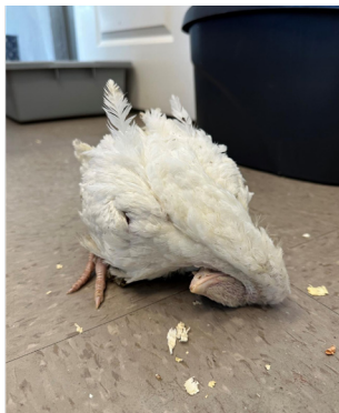
Neurological signs in a turkey from reovirus

Avian reovirus has been increasingly diagnosed in poultry submissions to the DSU. It typically causes viral arthritis/tenosynovitis in young broilers and commercial turkeys, and sometimes runting-stunting syndrome, a multifactorial disease. In older broiler breeders and turkeys, tendon rupture and hemorrhage are commonly seen. Recently in the US and in Canada, new strains of avian reovirus are causing encephalitis in turkeys. Common clinical signs include lameness, swelling of the hock, and stunting. Diarrhea and loss of color in the legs and beak may also occur. Neurological signs may include incoordination, tremors, twisted necks, or twitching. Mortality is typically low, but morbidity can be high. Presumptive diagnosis is by clinical signs and histopathology with confirmation by PCR. Ideal samples for reovirus testing include affected tendons, heart, and brain if neurological signs are present. Cecal tonsils are not preferred because enteric reovirus are common inhabitant of poultry. Other causes of lameness must also be ruled out. The disease often transmits vertically, and parent flock vaccination is an important preventative strategy. New strains are occasionally identified and need to be incorporated into vaccines to ensure ongoing efficacy.